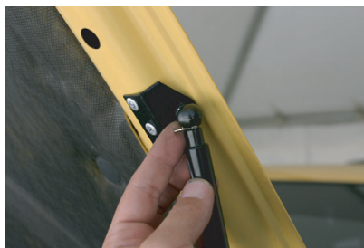
Slide clip down till it stops.