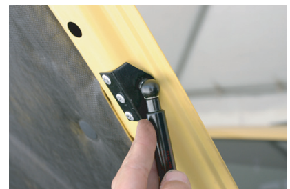
Rotate clip until it snaps onto shaft.