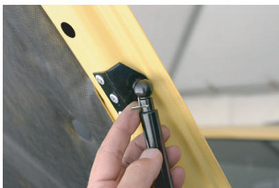
Insert clip into hole.

Note: You may find it easier if you first install the hood end of the springs, including locking clips, and then move to the lower fender ends last.