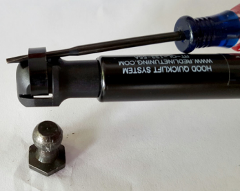
Step 1C Lift gas strut from ball-stud