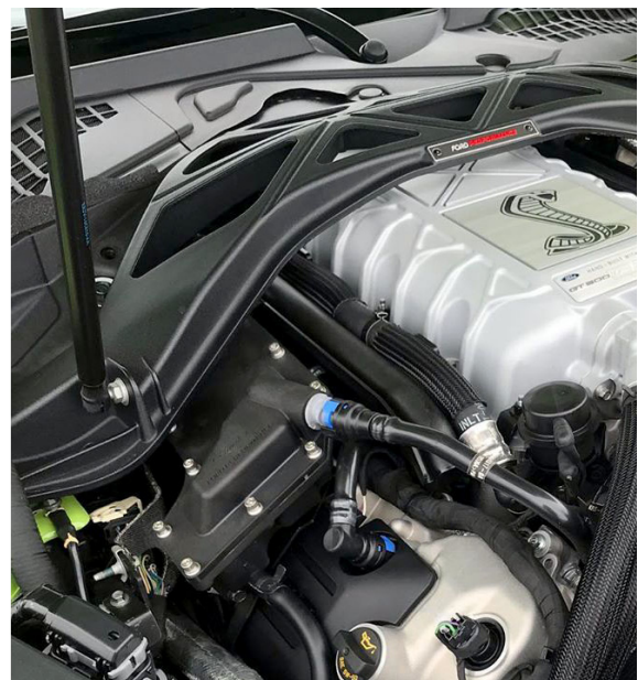
Step 5 Snap gas strut back onto vehicle.