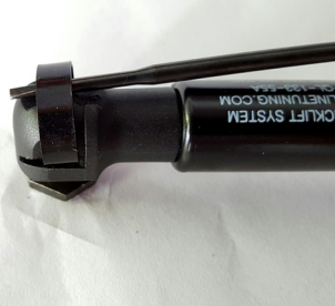
Step 1B Lift and rotate C-clip toward end as shown.