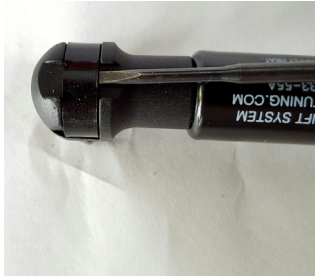
Step 1A Slide a small flat blade screw driver under the